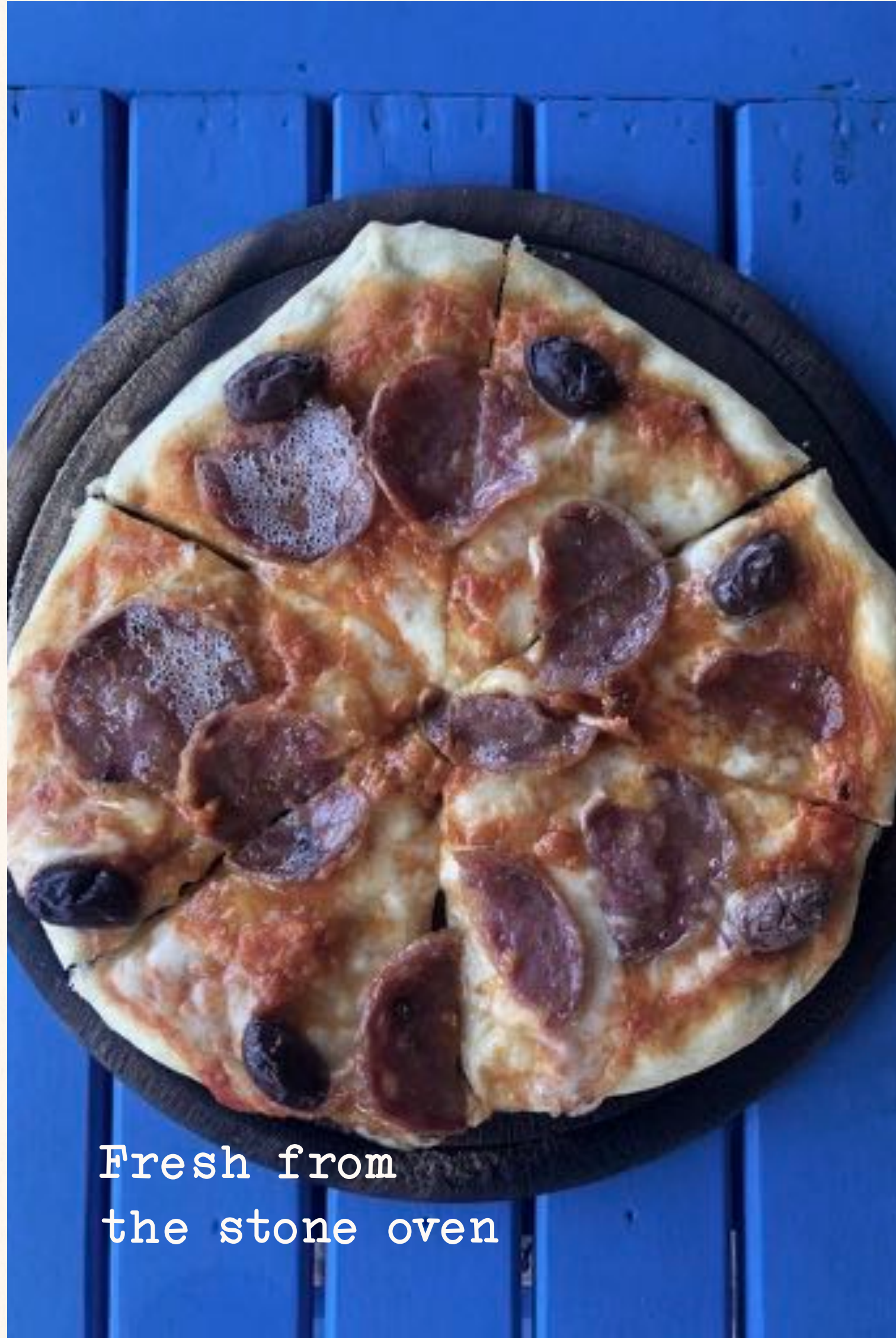
Fresh from the stone oven